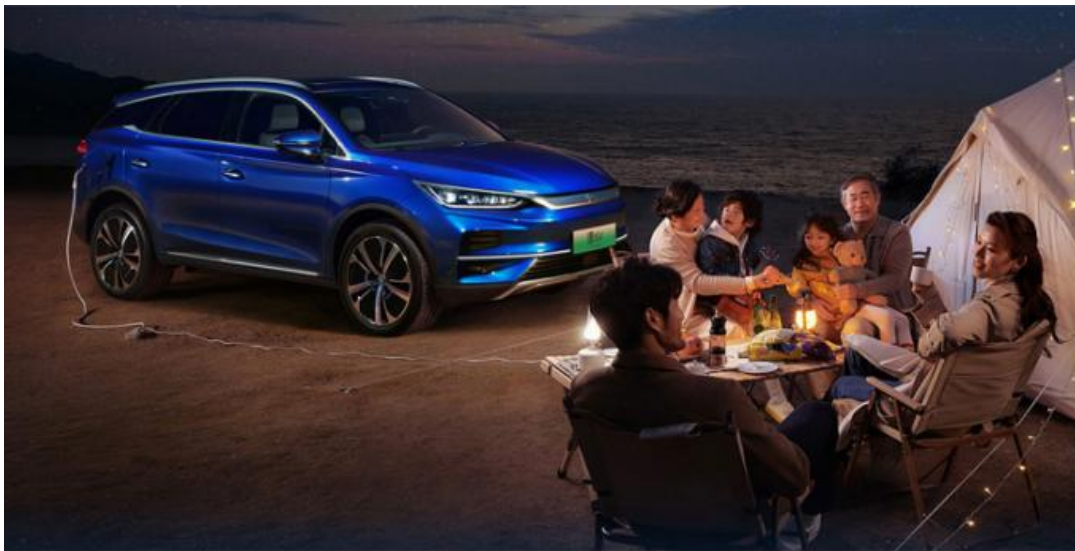
VTOL mobile power station