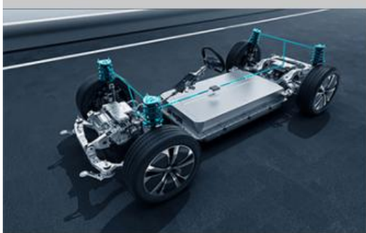
Disus-C Intelligent electrically controlled active suspension