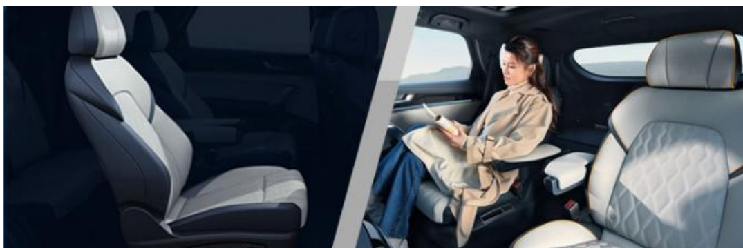
▲ Two separate electric seats