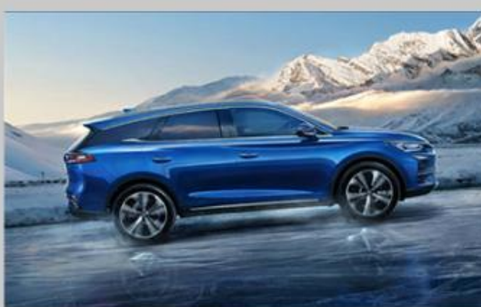
Super smart electric all-wheel-drive